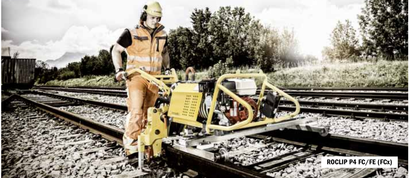
ROCLIP P4 FC/FE (FCx)