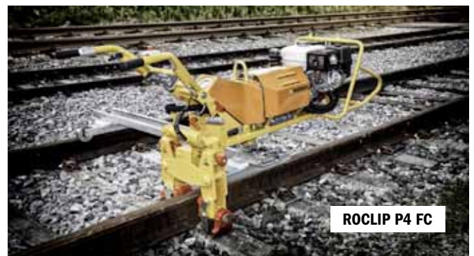
ROCLIP P4 FC